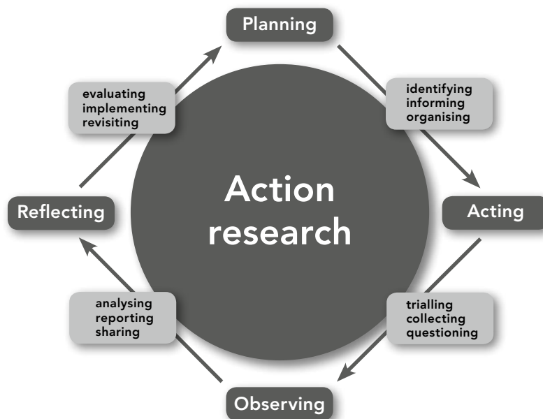
Figure 1: One ideal action research cycle

It might be represented diagrammatically as this: